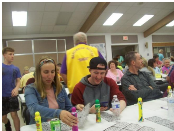
Last Monday our crowd numbered over 200 smiling faces