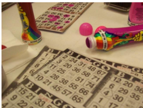
Come join our Lions on Monday nights at the Town Hall