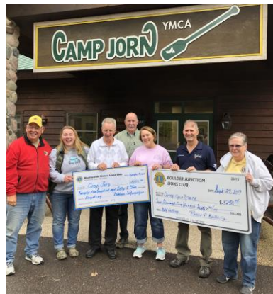
Golf Outing check presentation to Camp Jorn from Manitowish Waters and Boulder Junction Lions Clubs