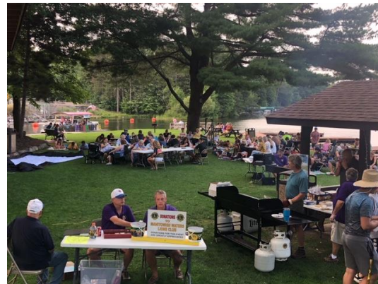
Lions Bingo in the Park – A Great Success